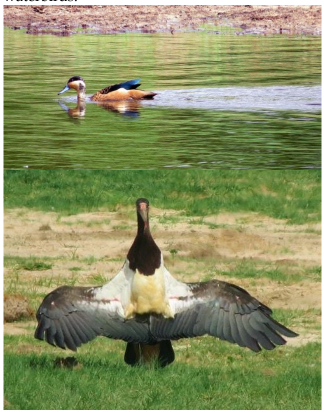
Hottentot Teal (above) & Abdim's Stork

Usually, birding in Hwange in late December/early January is fantastic as many of the migrants are around, particularly those big brown jobs flooding in for the termite alate flights along with some of our other annual visitors. Although the park had had some rain and outwardly everything seemed lush and green, it was evident that there hadn't been that much – yet. Some of the natural pans were beginning to fill up and most of the solar pumped pans we visited sported some waterbirds.