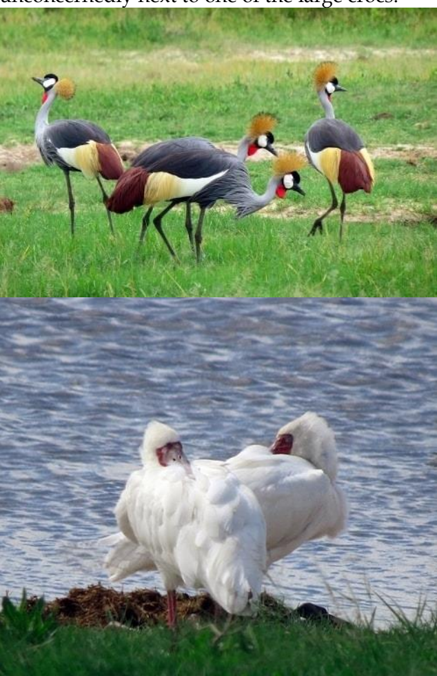
Grey Crowned Cranes (above) & African Spoonbills

took wing while noisily complaining. A few waders – Wood Sandpipers, Kittlitz's Plovers, a Common Greenshank and some Ruffs – fossicked along the edges of the pan and a group of Red-billed Teal rested on a sandbank quite unconcernedly next to one of the large crocs.