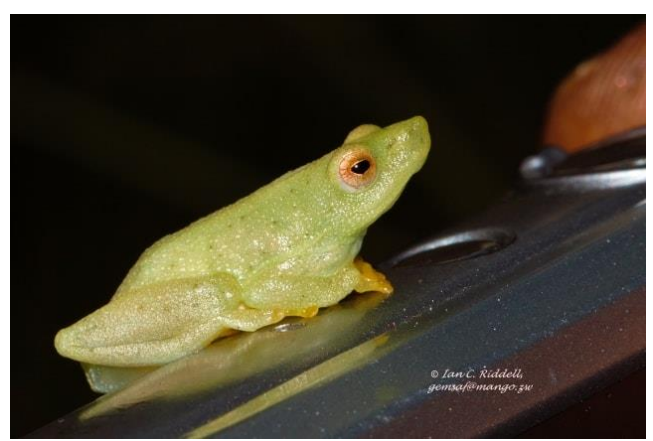
What was Hyperolius nasutus has been split! This is now H. inyangae , but how the taxonomists are going to treat the rest of the 'nasutus' group around Zimbabwe isn't yet resolved.